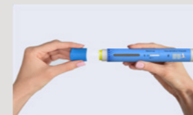
1. Remove safety cap