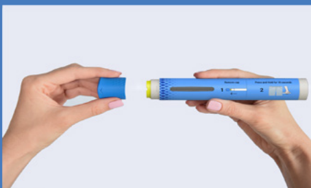
Remove safety cap